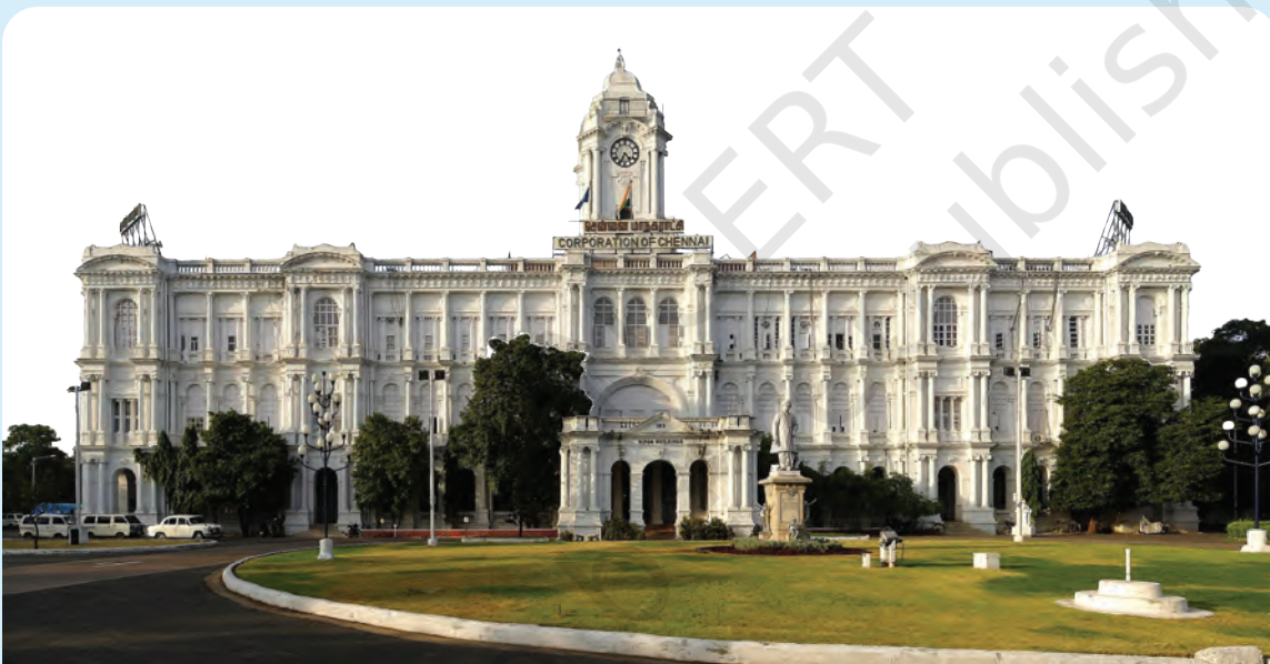
Fig. 12.3. The Madras Corporation

The Madras Corporation (now Greater Chennai Corporation), established on 29 September 1688, is the oldest municipal institution in India. The East India Company issued a charter the previous year constituting the town of 'Fort St. George' and all territories within 16 km from the Fort into a corporation. A Parliamentary Act of 1792 gave the Madras Corporation power to levy municipal taxes in the city, which is when the municipal administration properly began.