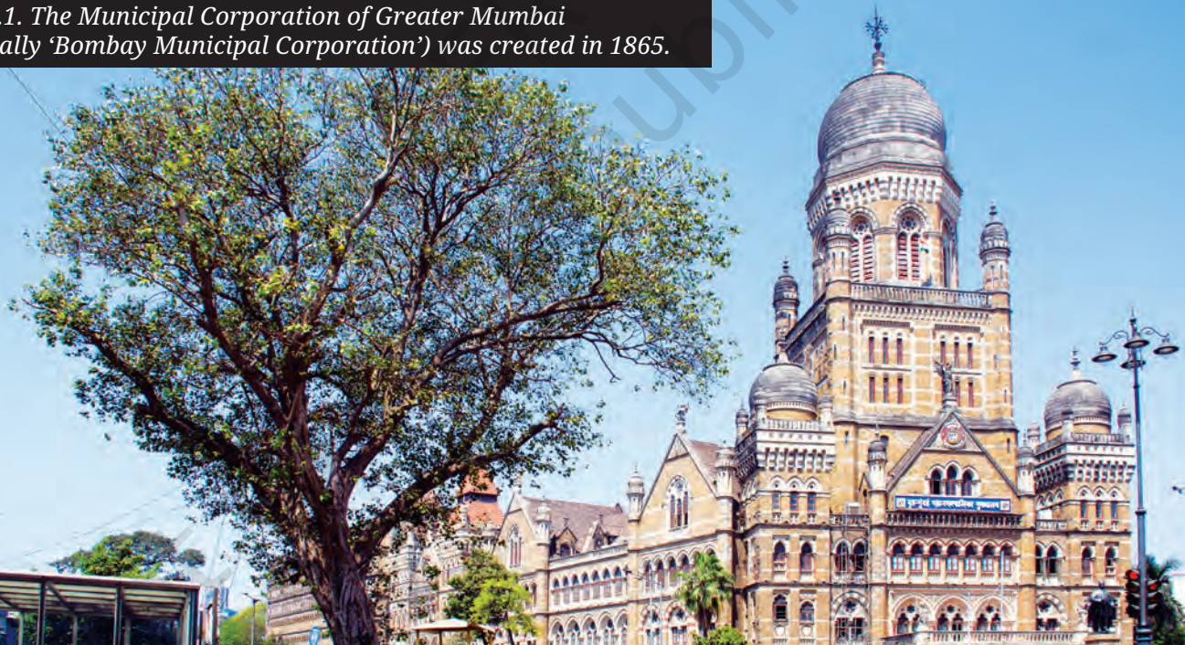
Fig. 12.1. The Municipal Corporation of Greater Mumbai (originally 'Bombay Municipal Corporation') was created in 1865.

— Rustom K. Sidhwa, Member, Constituent Assembly (during the Constituent Assembly Debates, 13 October 1949)