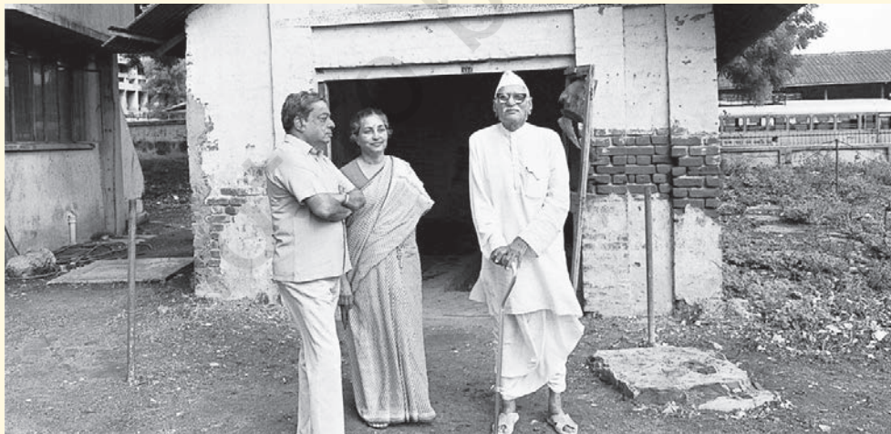
Varghese Kurien (left) and Tribhuvandas Patel (right)

AMUL was set up in 1946 under the leadership of Tribhuvandas Patel (lawyer and freedom fighter) and Dr. Varghese Kurien (an engineer who was working at a dairy factory in Mumbai).