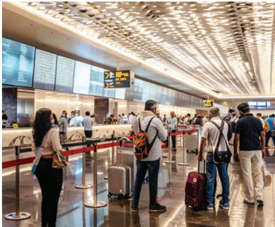
Services at airports