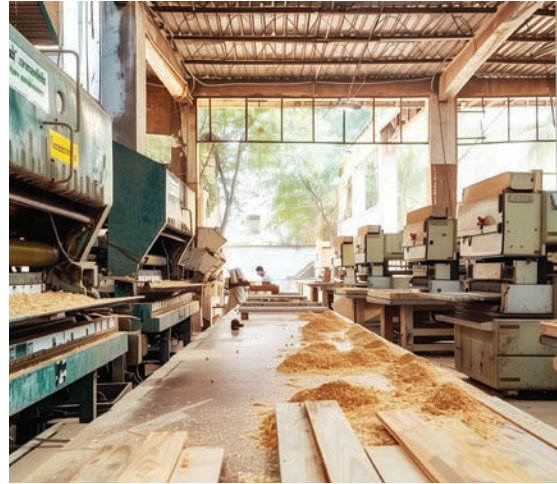
Furniture production unit