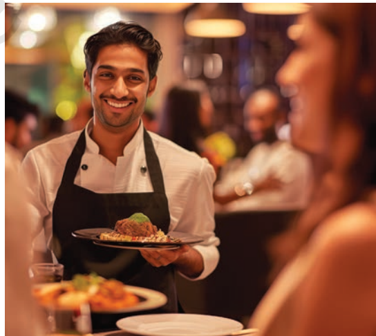
Services at restaurant