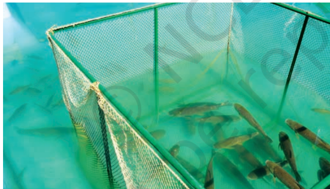
Fish farming (fishery)