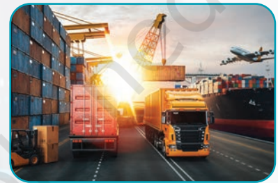
Trade and logistics