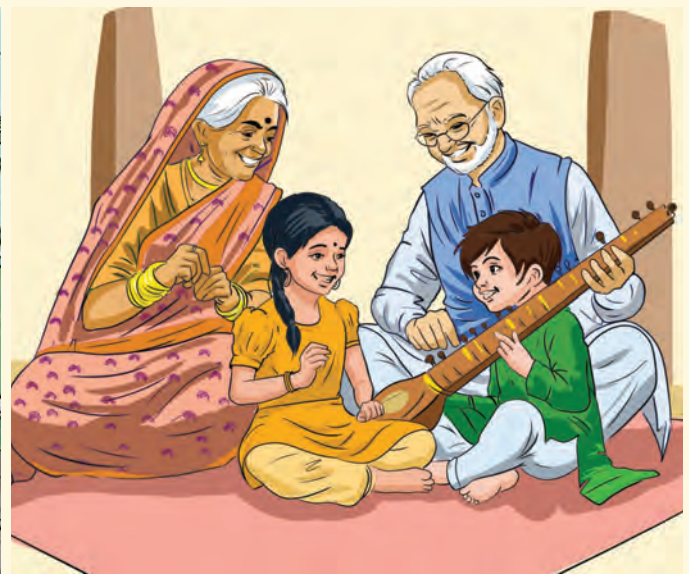
Examples of joint families